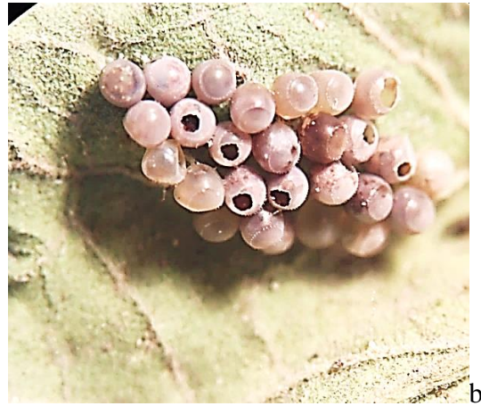
Figure 1. Parasitized eggs of H. halys (a) and exit holes of an egg parasitoid (b).