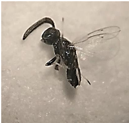
Figure 2. Adult of the egg parasitoid Anastatus bifasciatus (Geoffroy, 1785).