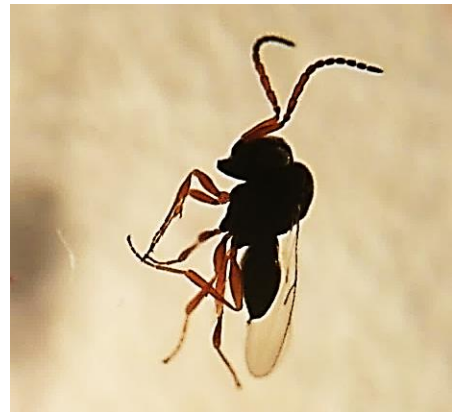
Figure 3. Adults of the egg parasitoid Trissolcus basalis (Wollastone, 1858).