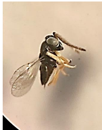
Figure 4. Adult of Ooencyrtus telenomicida (Vassiliev, 1904): female (a) and male (b).