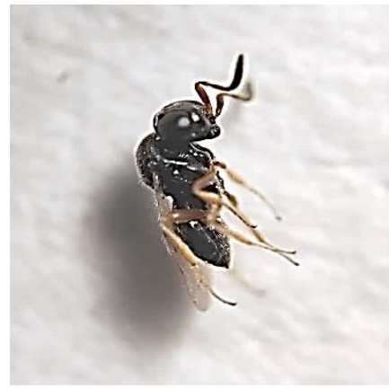
Figure 5. Adult of Trissolcus cultratus (Mayr, 1879).