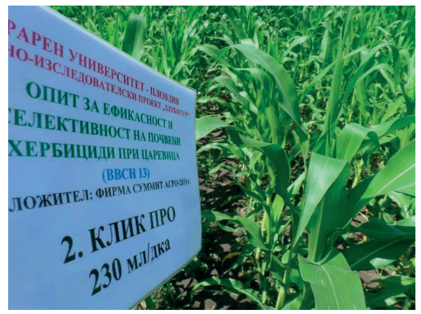
Picture 2. CLIK PRO (mezotrione 50 g/l + terbutilazine 326 g/l) SC - 230 ml/da