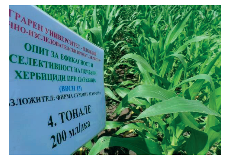
Picture 3. TONALE (mezotrione 75 g/l + terbutilazine 375 g/l + clomazone 40 g/l) - 200 ml/da

Climatic characteristic of the experimental season of maize.