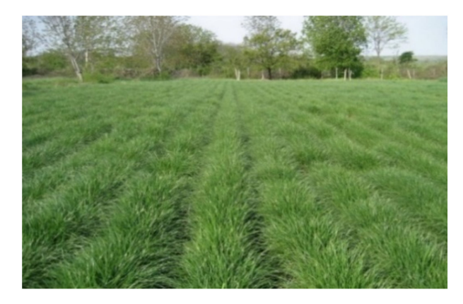
Figure 4. Perennial ryegrass ( Lolium perenne L.) Variety IFC Harmoniya. Author's photos of Prof. A. Katova.

IFC Harmoniya (Figure 4) is a diploid variety. The plants have a well-developed bearded root system, intensive tillering, with a semi-upright to upright habitus relatively resistant to lodging. The leaves are linearly flat or slightly curved, dark green, smooth and shiny on the underside [147].