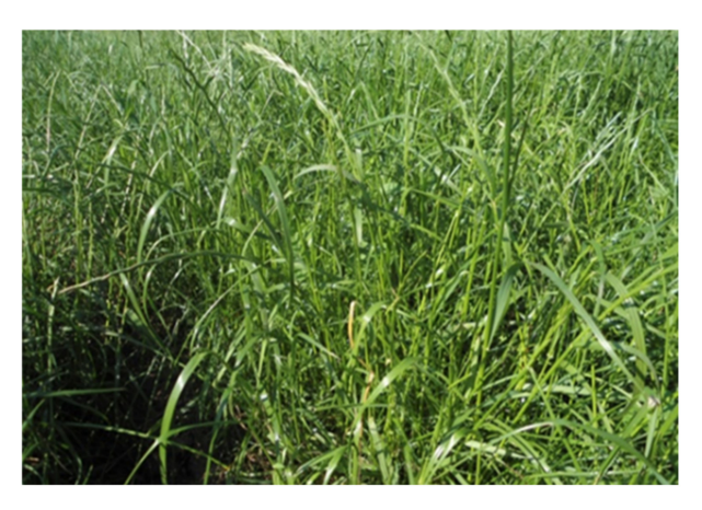
Figure 6. Perennial ryegrass (Lolium perenne L.) Variety Tetramis.

Two varieties of Agropyron sp. have also been created in recent years, both beginning vegetation in early spring when the soil warms up to 3–4 °C and continuying until the first frosts. They are characterized as having a very long durability over 10 years, a high winter hardiness and drought resistance, resistance to leaf diseases and tolerance to high summer temperatures.