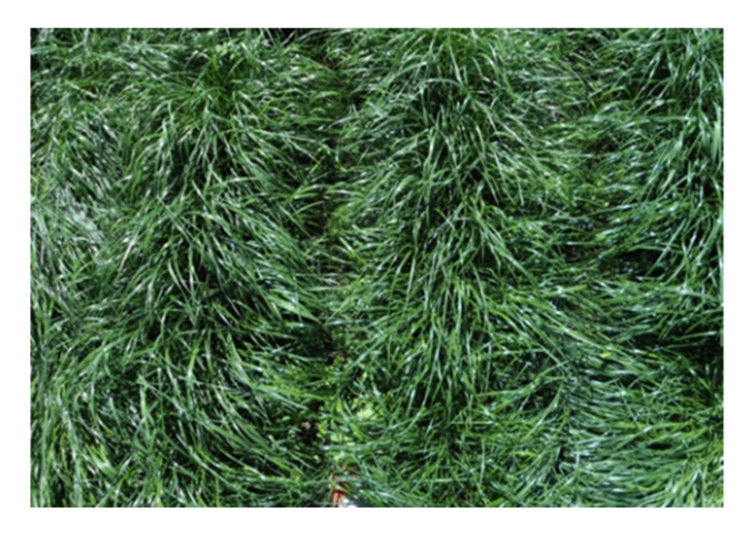
Figure 5. Perennial ryegrass (Lolium perenne L.) Variety Tetrany. Author's photos of Prof. A. Katova.

Tetrany (Figure 5) is a tetraploid variety of perennial ryegrass. It is early- to mediumearly, ecologically stable (winter hardy and drought tolerant), highly productive and long-lasting. The plants have a well-developed bearded root system, intensive tillering. They form numerous and well-leaved generative and vegetative shoots. The generative shoots are 2.8 mm thick stems, smooth, and relatively resistant to lodging, with 4–5 leaves. The leaves are linearly flat or slightly curved, very dark green, smooth and shiny on the underside. The variety is multifunctional, suitable for grazing, hay-grazing and ornamental use, alone or in mixtures with red fescue for decorative and sports-technical stands, with a high percentage of soil cover [148].