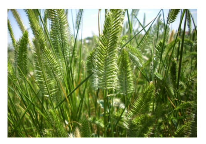
Figure 8. Standard wheatgrass ( Agropyron desertorum Fisch.) Variety Morava. Author's photos of Prof. A. Katova.