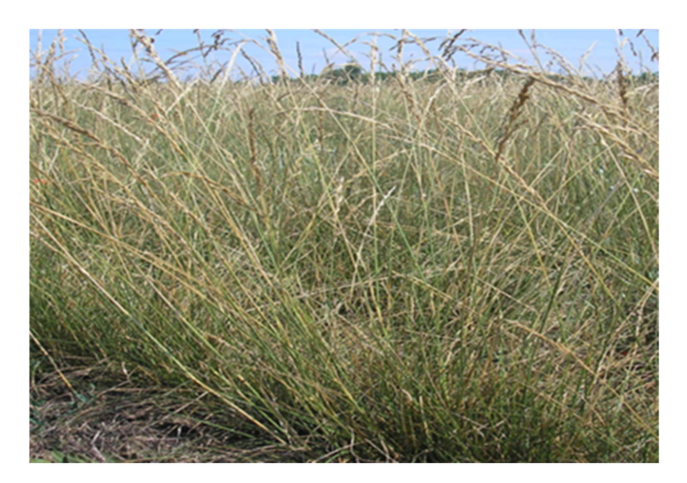
Figure 3. Tall fescue (Festuca arundinacea Schreb) Variety Albena.

Tall fescue ( Festuca arundinacea Schreb) Variety Albena (Figure 3)—The plants have a semi-upright habit. The generative shoots are relatively thin with 4–5 internodes, resistant to lodging. The variety is drought-tolerant, cold and frost resistant, and with high tolerance to leaf and stem rust. Plants are characterized by great vitality and longevity (over 9–10 years) [146].