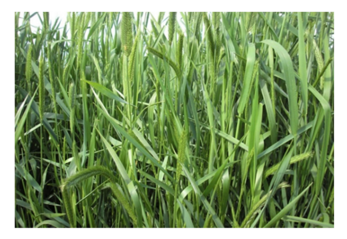
Figure 7. Crested wheatgrass ( Agropyron cristatum L.) Variety Svejina. Author's photos of Prof. A. Katova.

Crested wheatgrass ( Agropyron cristatum L.) Variety Svejina (Figure 7)—The plants are xeromesophytic with a deeply developed root system, mainly located in the soil layer up to 1 m and reaching a maximum depth of 2.4 m, with an upright habit. It forms numerous and well-leaved generative and vegetative shoots. The generative shoots are 1.8–2.0 mm thick, smooth, and resistant to lodging, with 5–6 leaves. The leaves are linearly flat, medium in size, slightly curved, are light to blue-green, smooth in length (17–18 cm) and width (4–5 mm), and the lowest ones are sometimes hairy. It is suitable for creating anti-erosion grass areas and maintaining the landscape [150].