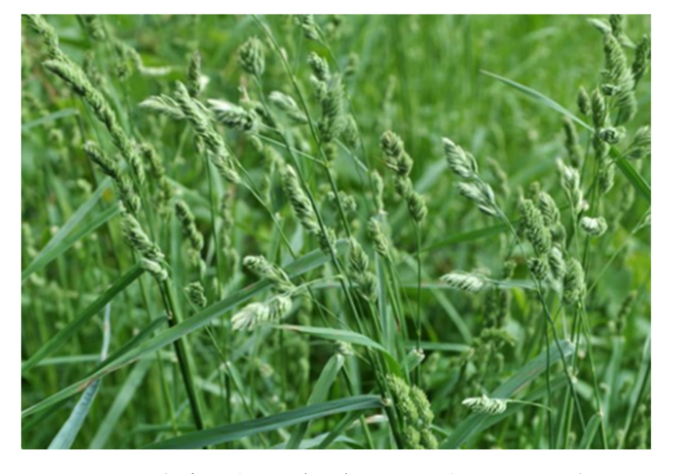
Figure 2. Cocksfoot (Dactylis glomerata L.) Variety Dabrava. Author's photos of Prof. A. Katova.

Cocksfoot ( Dactylis glomerata L.) Variety Dabrava (Figure 2)—The plants have an upright habit (hay type). It belongs to the group of medium-late varieties with great vitality and longevity of use. It is resistant to abiotic stress under the influence of drought and low temperatures, tolerant to leaf and stem rust with a prolonged period of use of 5 years or more [146].