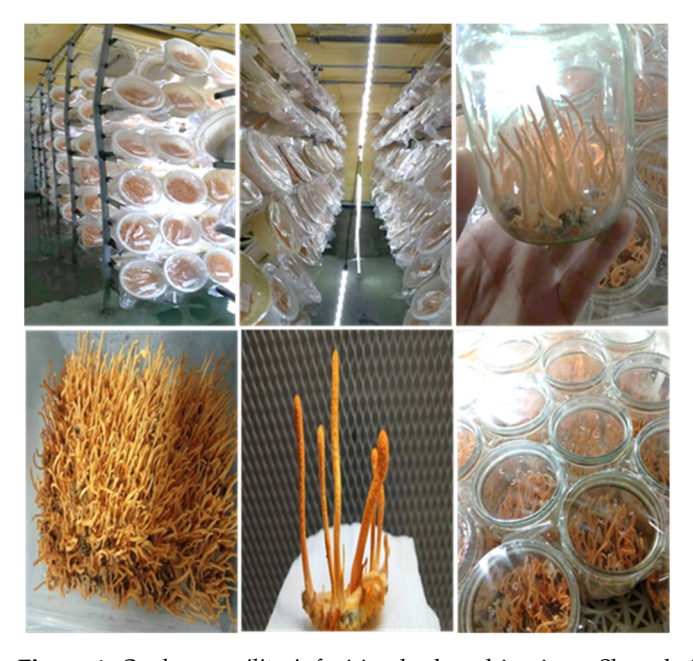
Figure 1. Cordyceps militaris fruiting body cultivation—Shanghai.

A total of 5000 L of working media were prepared, 2500 L of IM1 media and 2500 L of IM2 media, respectively. The resulting working media were poured into 12,500 \times 750 mL jars, filled to a volume of 200 mL for IM1 medium and 12,500 jars for IM2 medium. After sterilization, the media were inoculated with a liquid cell culture of Cordyceps militaris —Shanghai producer strain (Figure 1).