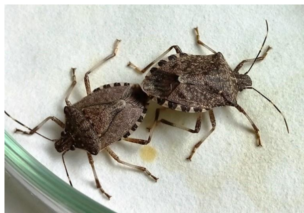
Fig. 3. Mating adults of H. halys

The longevity of the males and the females was 16.65 to 18.34 days, respectively.