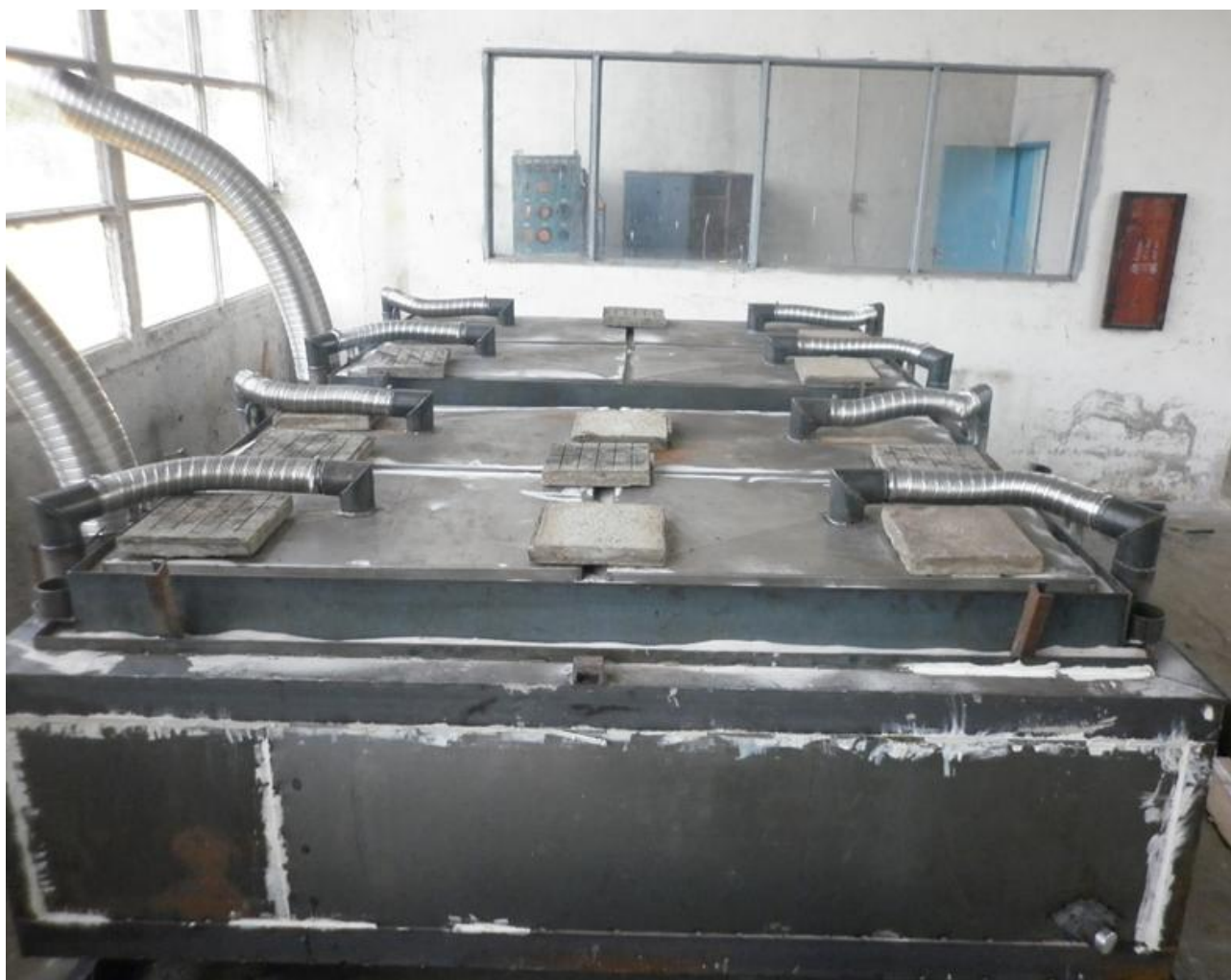
Fig. 1. Laboratory unit for the Study of calorific value of the biomass